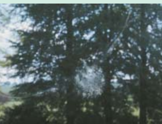
Top: Double glazed patio windows create a strong reflection and this may be one of the reasons why so many birds collide with them. Middle: Garden Warbler, one of the more unusual species to be recorded. Bottom: The imprints that birds sometimes leave behind after colliding with a window are formed by dust from their feathers.

Judging by the number of completed forms that have been returned, together with the amount of detail they contain, it looks as if the BTO Window Strikes Survey is going to provide us with some very useful information. Although analyses of the data received are still ongoing – with a view to publishing a report later this year – we thought that Garden BirdWatch participants might like to see some of the preliminary results. These are mostly descriptive in nature but give an indication of the sorts of things we are looking at. We hope to produce a set of guidelines on how to reduce the incidence of window strikes, based on the results of this work.