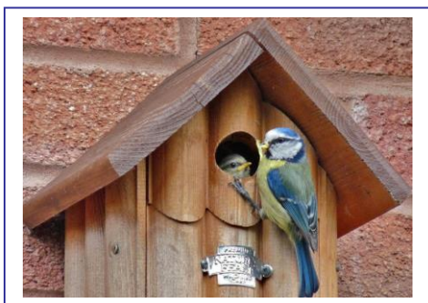
Blue Tit

I understand that the Swansea Waste Action Team in Clydach make nest boxes and bird tables from recycled materials (Tel: 01792 796886).