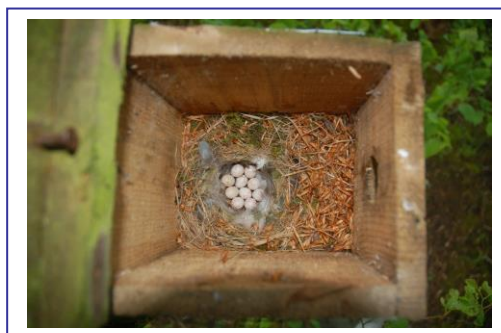
Blue Tit eggs: Mark Mainwaring/BTO