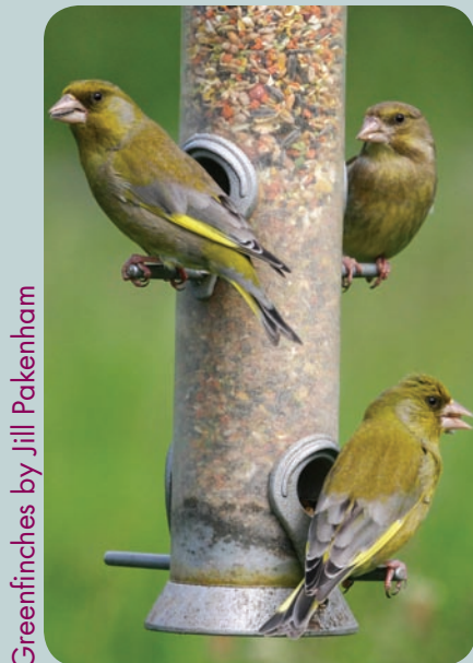
Greenfinches