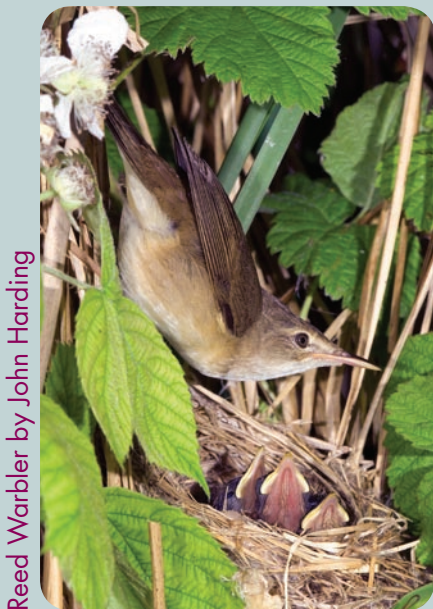
Reed Warbler