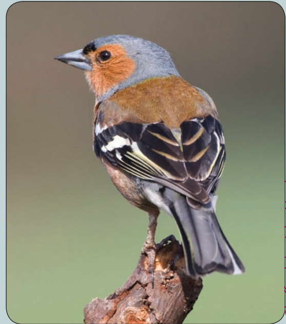
Chaffinch