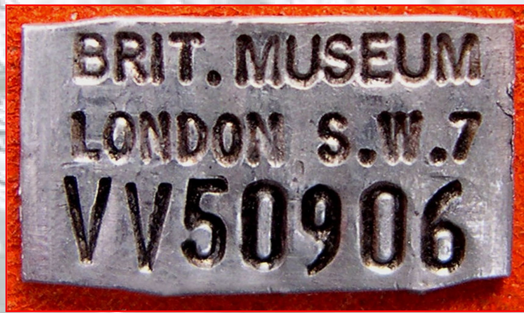
Actual size of a Greenfinch ring!