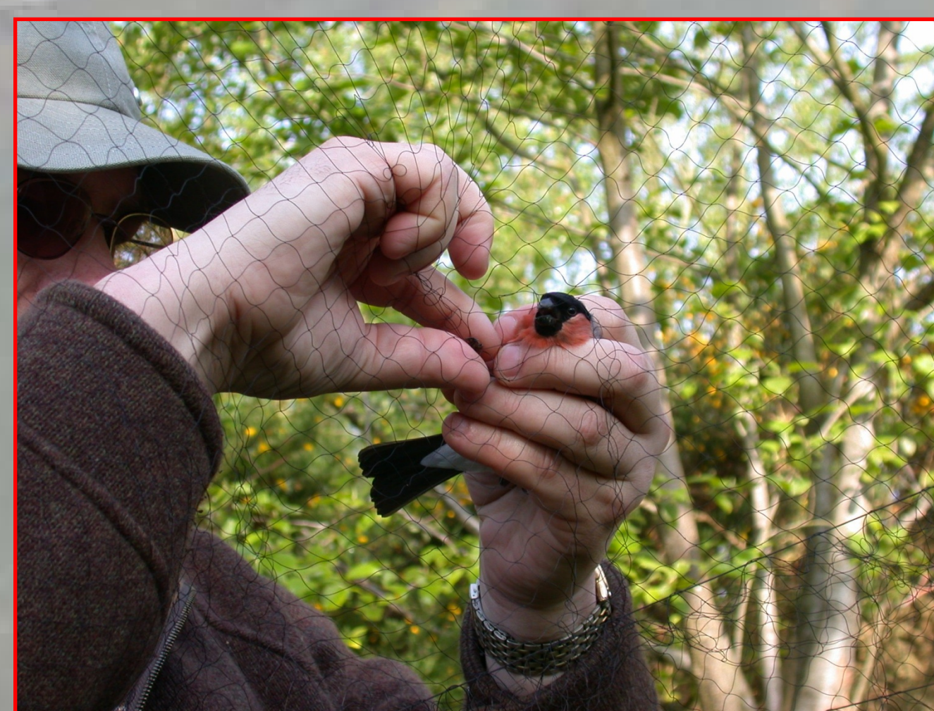
Taking a male Bullfinch out of a mist net