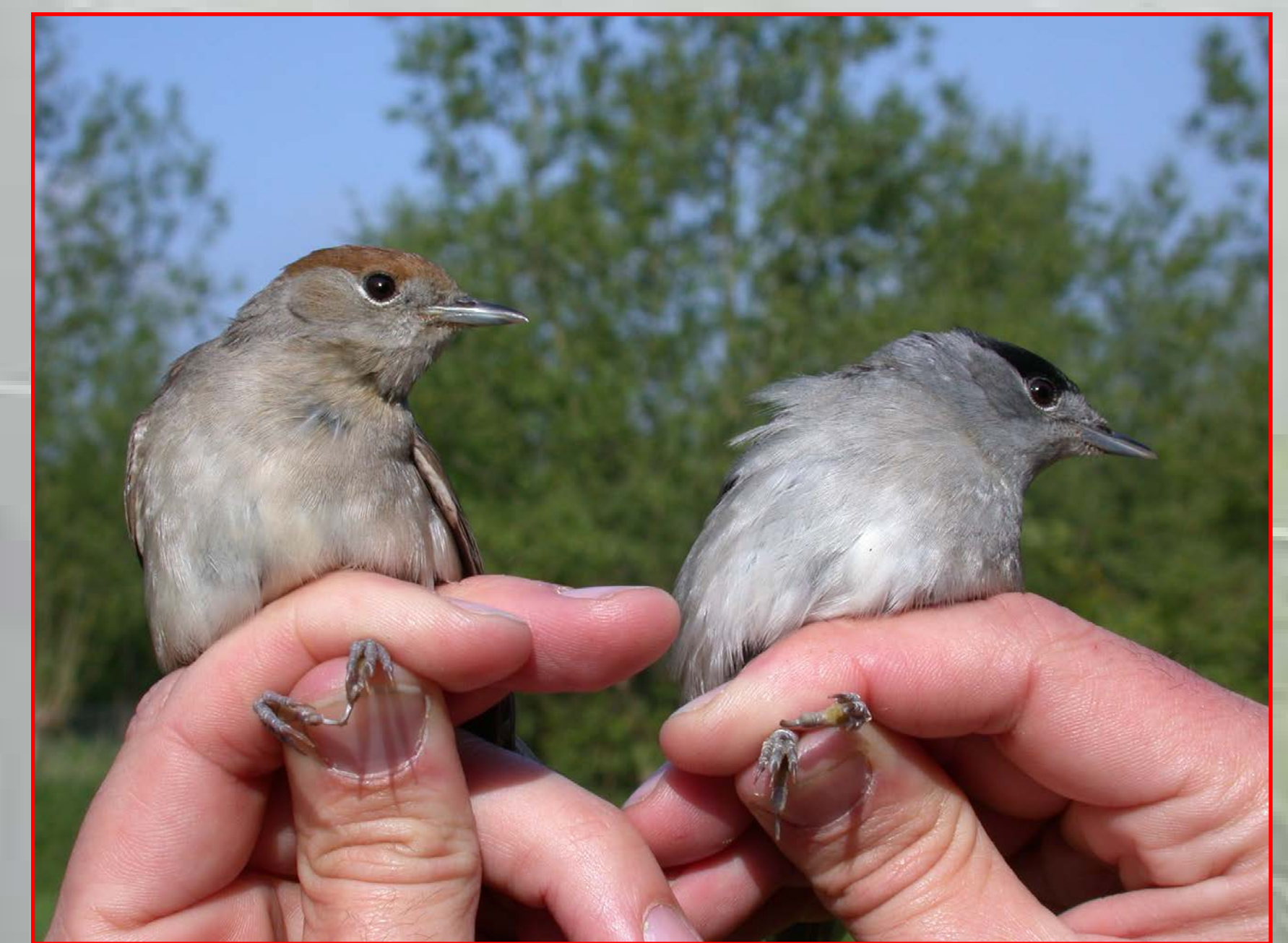
Male and female Blackcap

These are all key factors that control bird numbers. Understanding these can help us to see why species may be increasing or declining. This is vital information for the conservation of birds and their habitats.