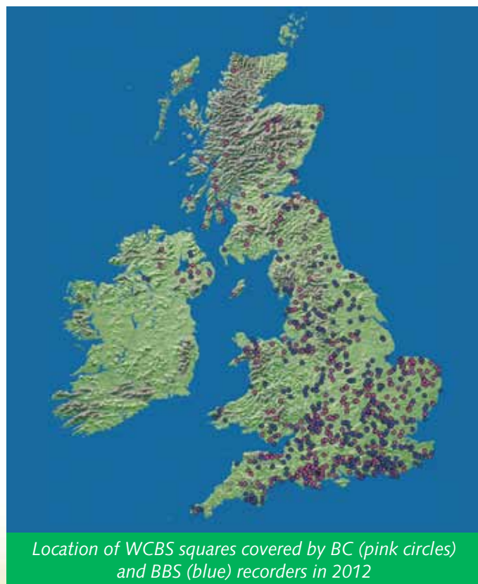
Location of WCBS squares covered by BC (pink circles) and BBS (blue) recorders in 2012

The time series of repeat sampled squares is developing well, with 350 squares surveyed in each of the four years of the survey and 70 squares with a six-year data run (including the pilot surveys of 2007 and 2008).