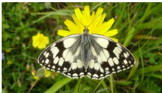
Marbled White – Martin Warren

It was a good year for some (though not all) of the grass-feeding Satyrid (Brown) species. For the fourth year in a row, Meadow Brown was the most abundant species with 18,629 individuals counted, almost twice as many as in 2011! Meadow Browns accounted for over one-third of all butterflies recorded during July and August. This species was also the most widespread butterfly for the third successive year occurring in 89% of squares, compared with 81% in 2010 and 2011. The maximum Meadow Brown count was 508 in a square in Gloucestershire on 27 July. The five highest day counts for individual species in 2012 were all of Meadow Brown, including in Bedfordshire, Dorset and Warwickshire. Substantial annual increases in Meadow Brown numbers within survey squares included from 11 in 2011 to 67 in 2012 in West Yorkshire and from 15 to 67 in Hertfordshire. Ringlet had a good year rising four places in occupancy ranking, being found in almost two-thirds of squares compared to half of squares in 2011.