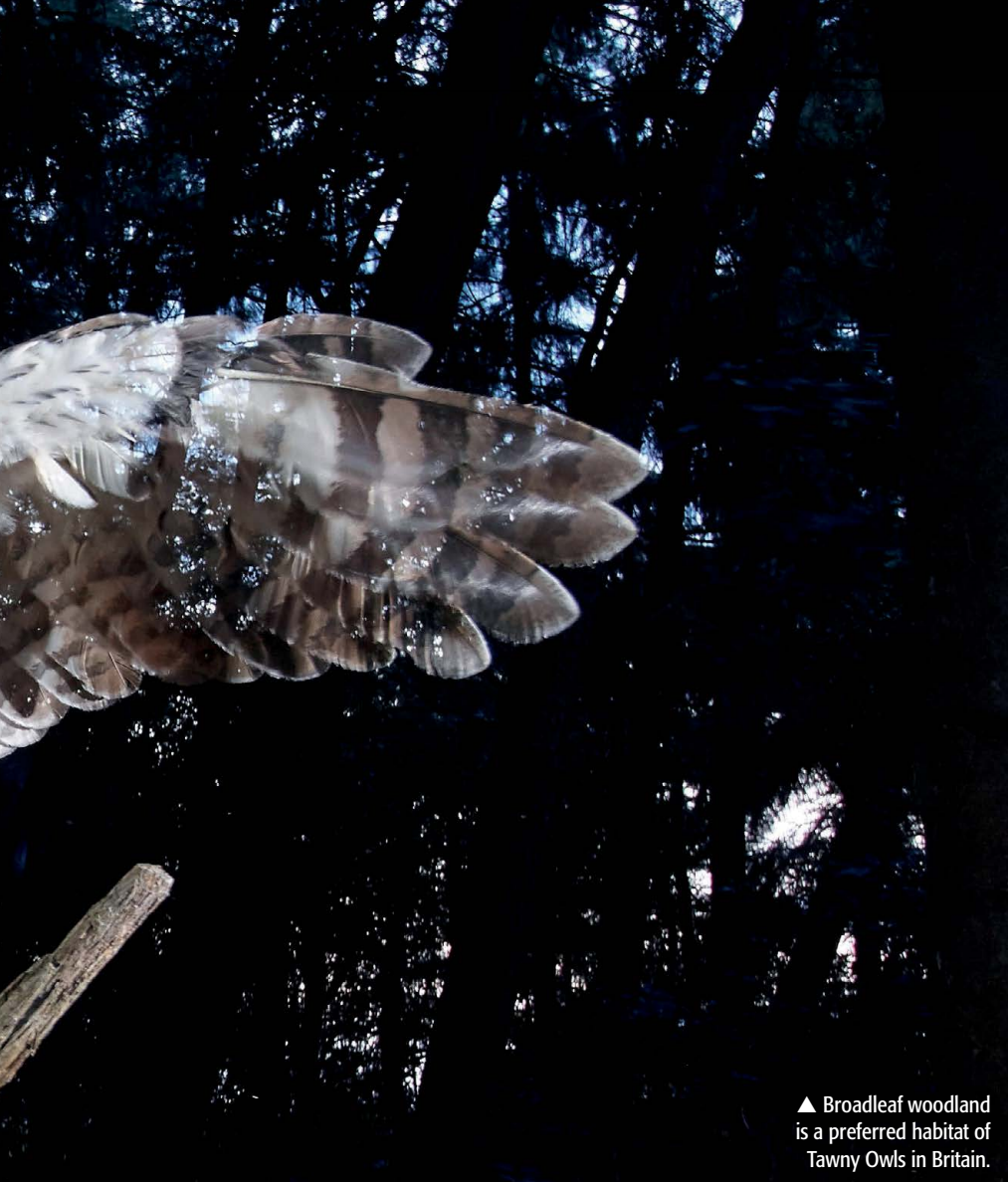
▲ Broadleaf woodland is a preferred habitat of Tawny Owls in Britain.

effects of artificial light on their small mammal prey, making less food available.