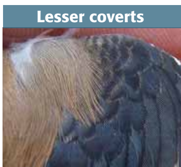
Adult female/Juvenile female