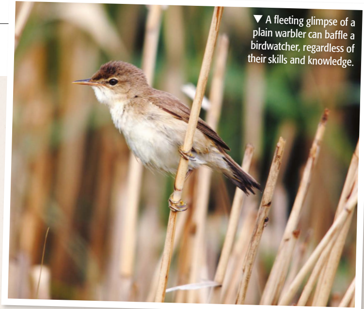
▼ A fleeting glimpse of a plain warbler can baffle a birdwatcher, regardless of their skills and knowledge.

plain-looking warbler or the thin, high-pitched alarm calls given by several of our songbirds. Recognising the inherent difficulty of bird ID is an important first step towards: