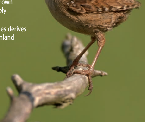
Main image, Wren by Steve Round; inset Shetland Wren by Jill Pakenham - BTO Collection

The development of island races or subspecies derives from their isolation. Separated from the mainland populations, there is scope for divergence in characteristics, like song or body colour. The island forms also show differences in their behaviour, with the males typically more supportive of their mates during the breeding season.