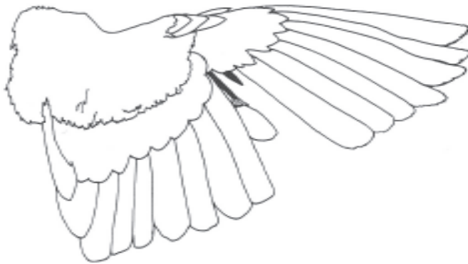
Example 1: Early wing moult