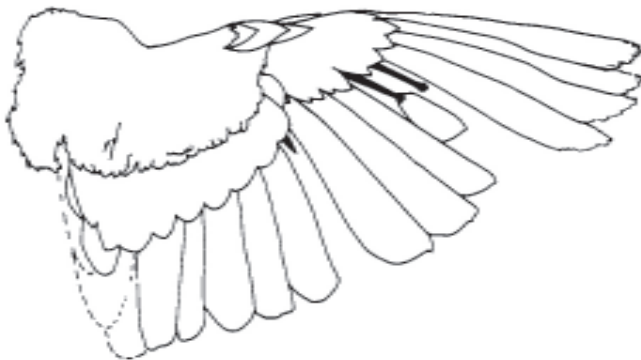
Example 2: Mid wing moult